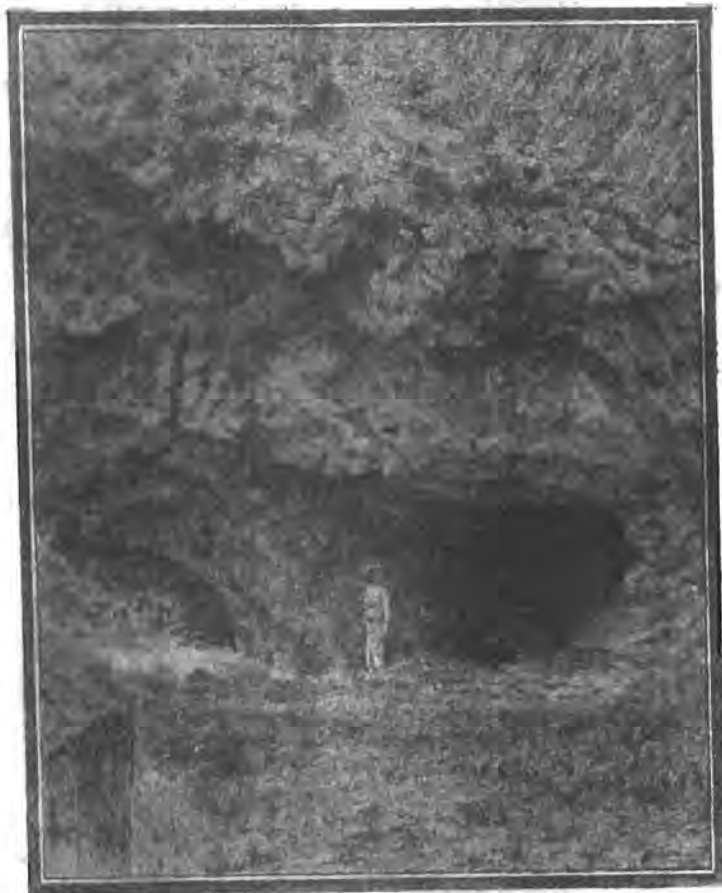
ROSE HILL QUARRY.